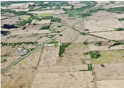
I-74 Site from South